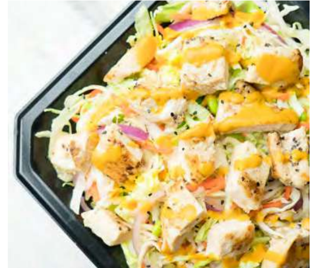
Fresh Mix Salad