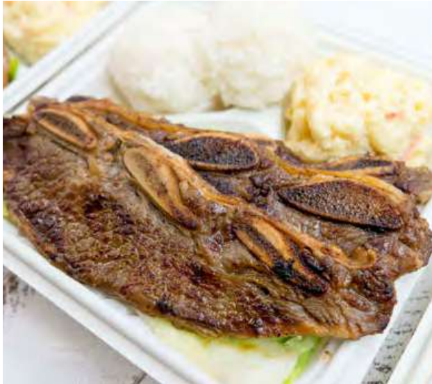
Kalbi Short Ribs