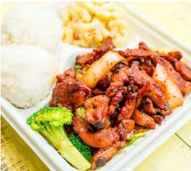
Island Fire Chicken