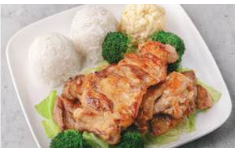
HAWAIIAN BBQ CHICKEN

Slow roasted pork with a hint of smokey flavor, served shredded over steamed cabbage. Hawaii's version of pulled pork.