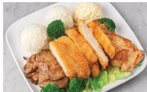
BBQ & KATSU MIX