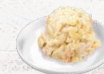
MAC SALAD ( 1 SCP )