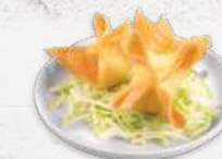
CRAB RANGOON ( 3 PCS )