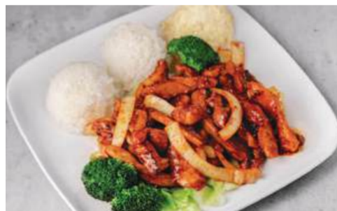
🔥 ISLAND FIRE CHICKEN