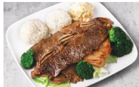
HAWAIIAN BBQ MIX