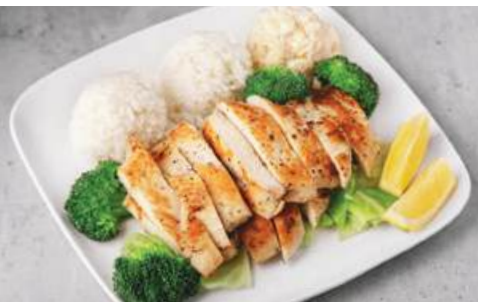
♥ GRILLED CHICKEN BREAST LEMON PEPPER / TERIYAKI