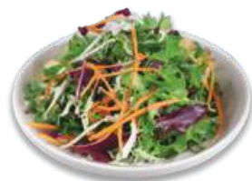
SIDE OF ISLAND SPRING MIX SALAD

MACARONI SALAD 2 SCPS / 4 SCPS / 6 SCPS ❤️ SUBSTITUTE MAC SALAD W/ ISLAND SPRING MIX SALAD IN ANY PLATE LUNCH (+.25)